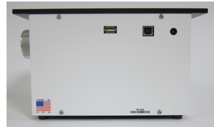
Fig. 1. Photo of Lumascope 500 back panel.

If Lumaview 500/400 has not been run previously, it is important that the USB cable be connected first between the LS500 and computer. This is because Windows needs to load the USB driver before Lumaview is launched. After the first time, the program can be launched without the USB cable connected. However, only the Outer Main Window will open (see following section). Connect the USB cable between the LS500 and computer and the Live Window will open.