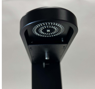
Multi-mode transmitted illumination technology