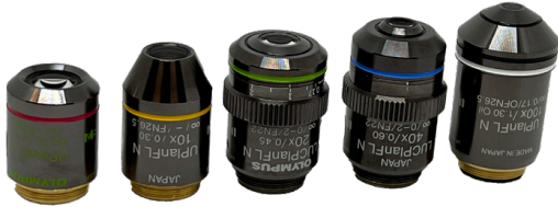
Uses real microscope objectives

The Lumascope 800 Series is a multi-channel automated inverted microscope platform which offers the latest advances in optics, cameras, and user flexibility. The LS820 and LS850 in your incubator allows you to have a live cell imaging system that offers minimum phototoxicity and the most stable environment for long-term imaging.