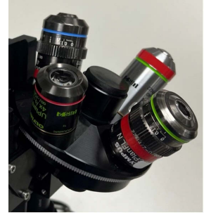
Optional motorized 4-position turret available on the LS850