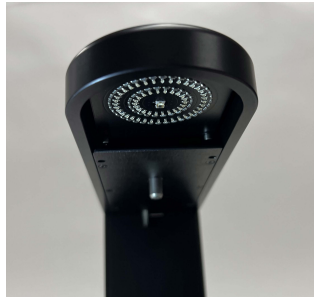
Multi-mode transmitted illumination technology