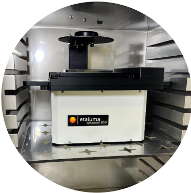
Live cell imaging is our specialty

High Resolution 3-Color Fluorescence Live Cell Imaging in Your Incubator