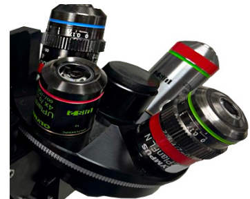
Optional motorized 4-position turret available on the LS850