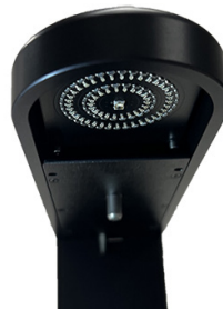
Multi-mode transmitted illumination technology