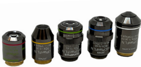
Uses real microscope objectives

The Lumascope 800 Series is a multi-channel automated inverted microscope platform which offers the latest advances in optics, cameras, and user flexibility. The LS820 and LS850 in your incubator allows you to have a live cell imaging system that offers minimum phototoxicity and the most stable environment for long-term imaging.