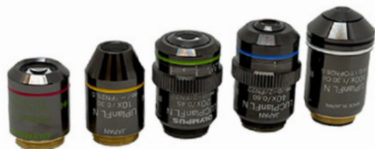
Uses real microscope objectives

The Lumascope model 850 is a multi-channel automated inverted microscope which offers the latest advances in optics, cameras, throughput, and user flexibility. The LS850 in your incubator allows you to have a live cell imaging system that offers minimum phototoxicity and the most stable environment for long-term imaging.