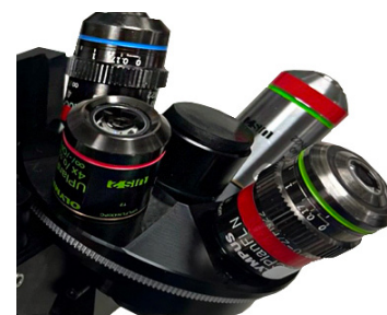
Optional motorized 4-position turret