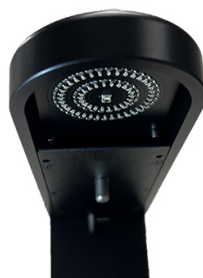
Multi-mode transmitted illumination technology