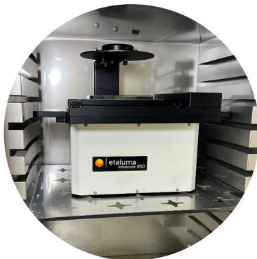
Live cell imaging is our specialty

The LS850 offers walk-away automation with the highest quality wide field microscopy images for your research.